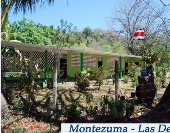
Montezuma - Las Delicias - Cabuya